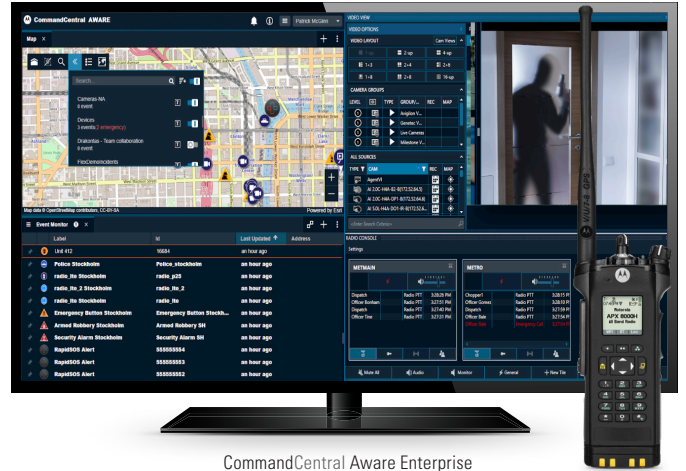
CommandCentral Aware Enterprise

Because enabling rapid response and documenting past incidents can be the key to preventing incidents from becoming tragedies.