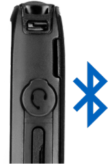
SUPPORTS OTHER 3RD PARTY 3.5 MM AND BLUETOOTH ACCESSORIES