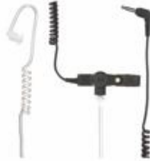
3.5MM TWO-WIRE EARPIECE WITH TRANSLUCENT TUBE