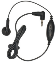
3.5MM EARBUD WITH INLINE MICROPHONE AND PUSH-TO-TALK