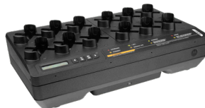
MULTI UNIT CHARGER

Charge the LEX L11 and it's spare battery at once