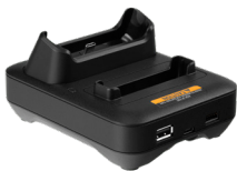
SINGLE UNIT DESKSET CRADLE

NEVER SLOW DOWN JUST SWAP OUT THE DEPLETED BATTERY FOR A NEW ONE