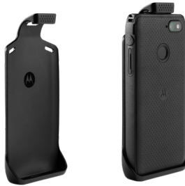
LEX L11 HOLSTER WITH AUDIO ROUTING TECHNOLOGY