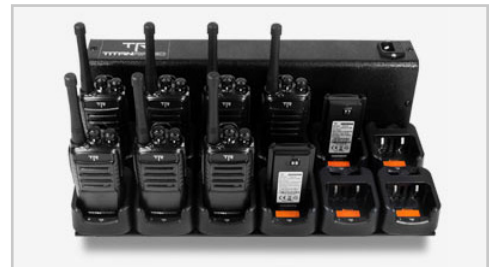
6, 12, or 18 Bank Charger