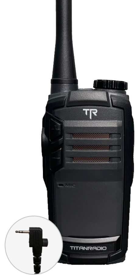
Single-Pin Screw-Down Connector